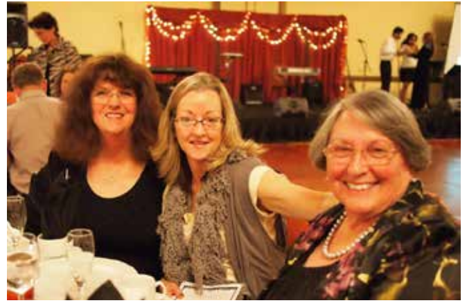
MFMI Students Perform at the MFMI 25 th Anniversary Benefit Gala