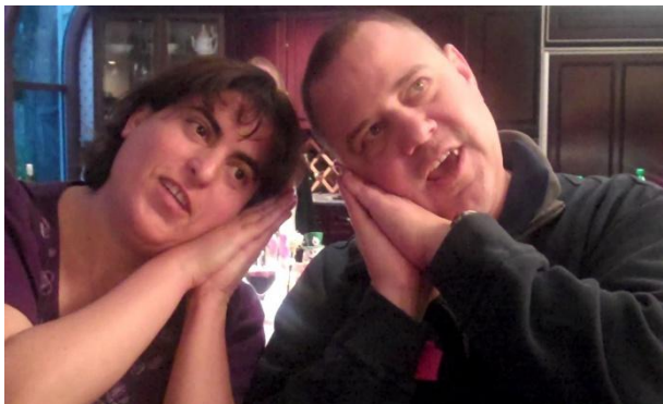
Two Turtle Doves and 12 Days of Christmas!