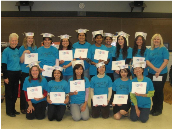
And More Docents! Ohlone College Graduation