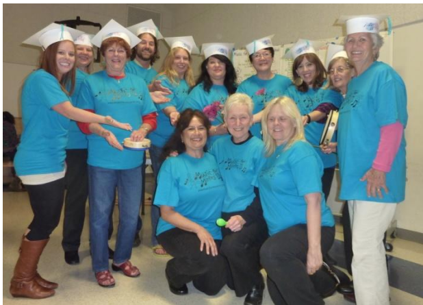
And More Docents! CV Graduation

As we come to the year’s end, Music for Minors II (MFMII) celebrates with joy the graduation of 28 new docents and 4 new schools joining the program which means that more than 1,000 additional students will be enriched by these enthusiastic new docents bringing MFMII’s service currently to over 5,000 children weekly.