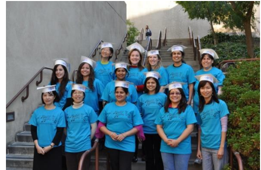
Fremont New Docent Graduation Class of 2010