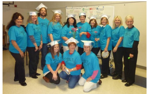
CV New Docent Graduation Class of 2010